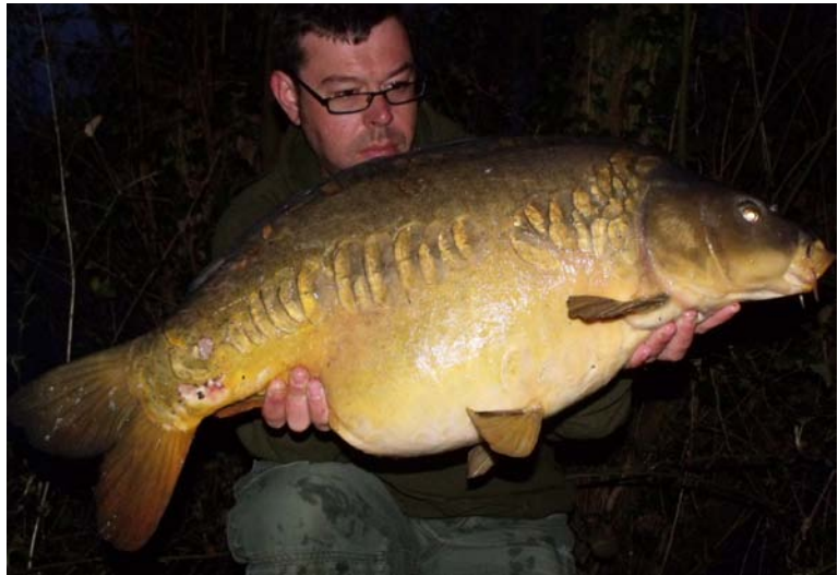
The editor with a scaley upper twenty, he does catch occasionally!

A few members are having a go for the roach